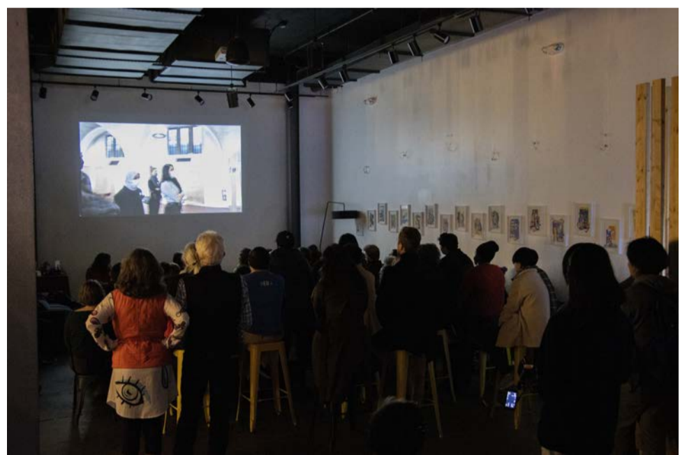
COVID-19 Third Anniversary Screening in Long Island City, 2023

📅 Saturday, March 16 🕒 11 - 4pm EST 📍 Queensbridge Tech Lab