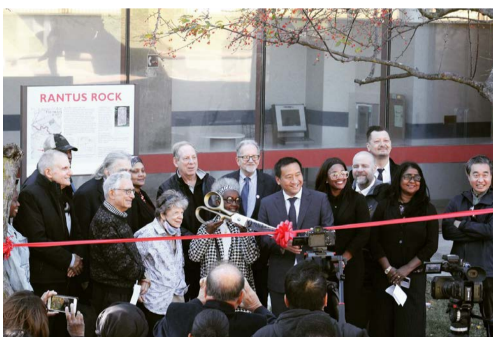
Ribbon-cutting ceremony for the Wilson Rantus Rock, 2022

Queens Public Library is proud to be a COAL + ICE Climate Action Partner! Our climate-focused programming aims to inspire deeper engagement and meaningful dialogue on how the climate crisis affects our global and local communities.