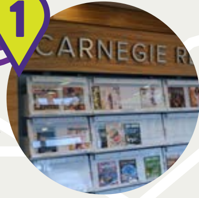
QUEENS PUBLIC LIBRARY AT ELMHURST