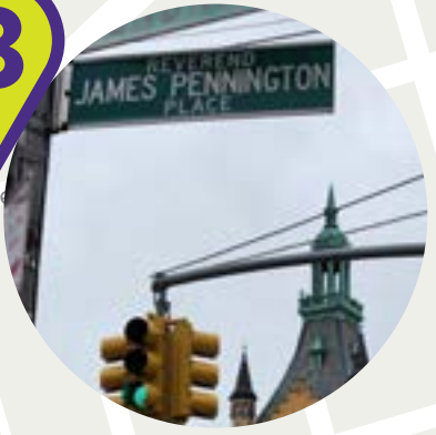
REVEREND JAMES PENNINGTON PLACE