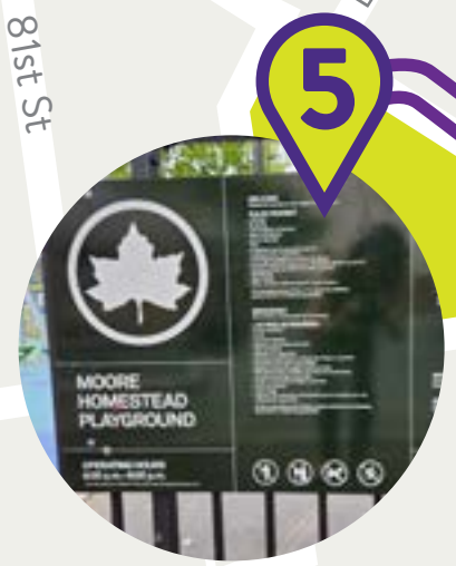
MOORE HOMESTEAD PLAYGROUND