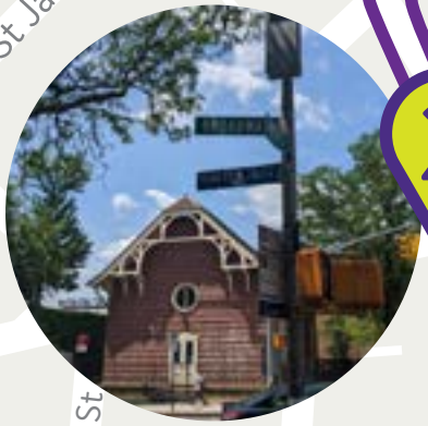
ROBERT R. TILTZ STREET