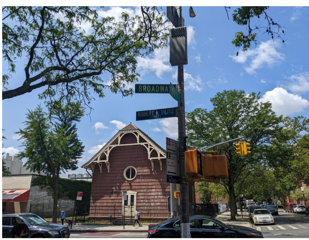
View of Old Saint James Episcopal Church (built in 1735-36), Explore the historically diverse neighborhood of Elmhurst, Queens on this walking-tour-turned scavenger hunt that Queens Memory has organized in collaboration with Urban Archive and Open House New York.

The scavenger hunt offers insights into local history and archives, while illuminating landmarks that honor community leaders from the 1700s to the 21st century.