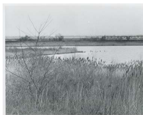
A 1969 image of Jamaica Bay Wildlife Refuge, from the Urban Nature City Story

Urban Nature. Sound like a paradox? To some, yes. While New York City is generally known for its huge buildings and concrete, we can't overlook the beaches, parks, and general nature that beautify it. We'll be taking a historic look at some of these sites in Queens that folks can't get enough of. So when you want to get away from endless car horns and hear the song of the American Avocet, come back to this guide!